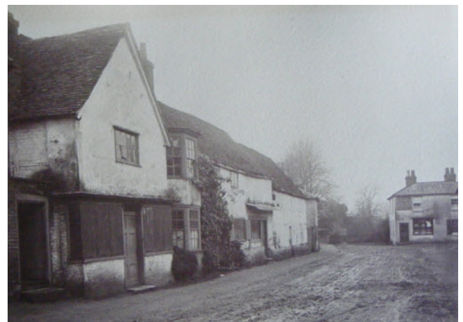
The cover of one of the albums (top), one of the first prints seen, of Wargrave High Street (left upper), Church Street, with the bakery in the distance (right upper, the drawing of Queen Emma's Palace' (lower left), and the house interior - with album on the round table (lower right).