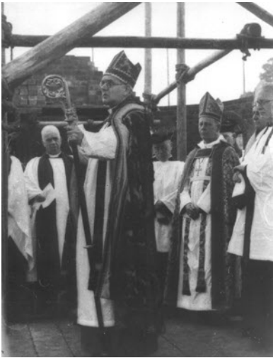
Pictures from the Piggott School - the laying of the foundation stone in 1939 (upper left), pupils building an astronomical telescope in 1951 (upper right), the girl's hockey team in about 1956 (below left), and a rural studies class of the late 1940s (below right).